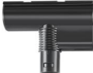
Mattress motorized brush