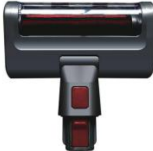
Small motorized brush