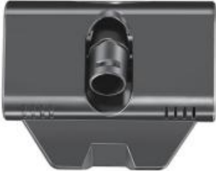
UV mite removal brush