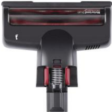
WB03 motorized brush