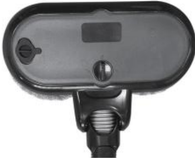
Mop motorized brush