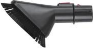
Furniture suction nozzle