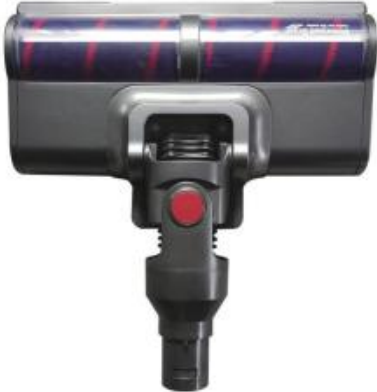
WB01 motorized brush