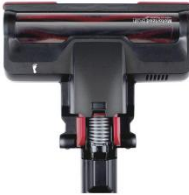
WB02 motorized brush